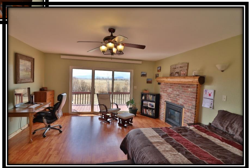
Doors Out To Private Deck