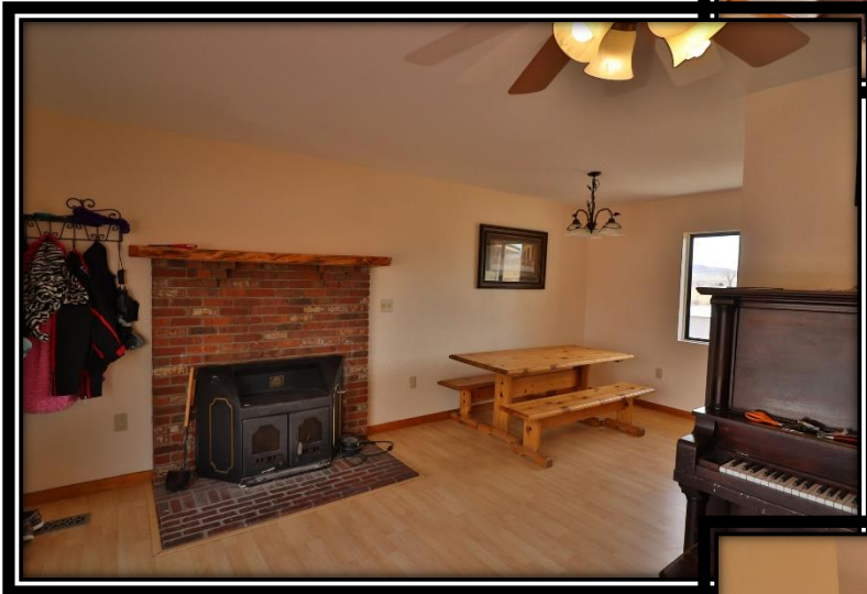
Wood Stove Insert