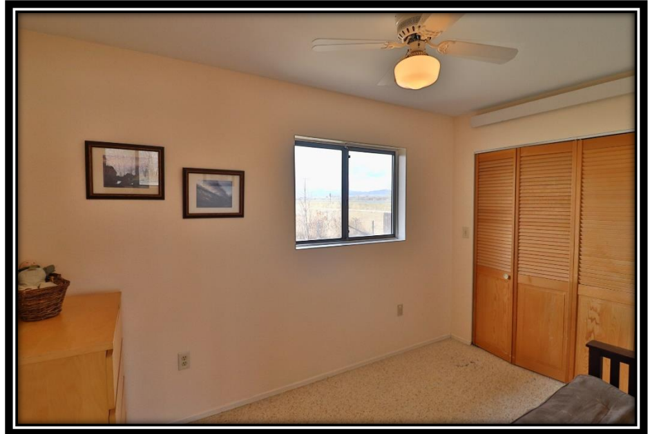
Guest Bedroom Mai Level